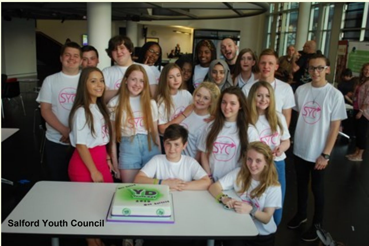
Salford Youth Council

Find us on Facebook: /wuu2insalford or Twitter: @wuu2salford